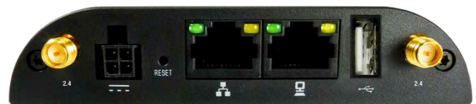
POWER / RESET / LAN / WAN / USB COR IBR600

*WiFi is only supported on IBR600 models.