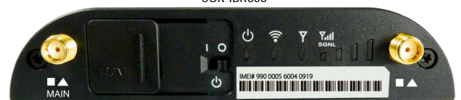
SIM SLOT / ON-OFF / LEDs / SIGNAL STRENGTH COR IBR600